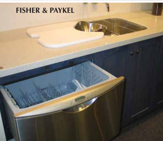
FISHER & PAYKEL